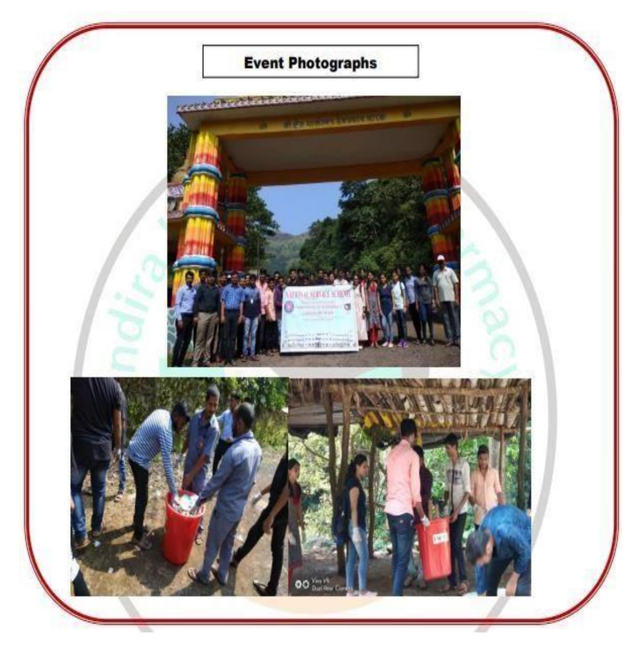
Cleaning drive at Marleshwar Temple

A/P. Sadavali (Devrukh) Tal: Sangameshwar, Dist: Ratnagiri-415804 (Maharashtra) Phone: 02354-241799 Fax: 02354-241499 E-Mail: info@iip.ind.in Web: www.iip.ind.in NAAC Accredited