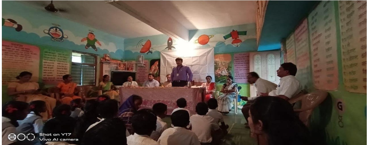
Inauguration of Health check-up camp at Kankadi Z.P. School