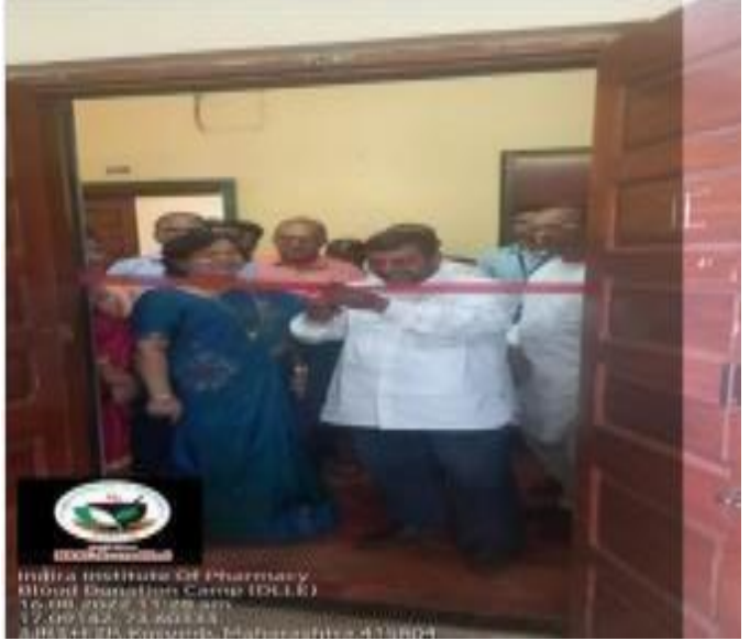
Inauguration of blood donation camp