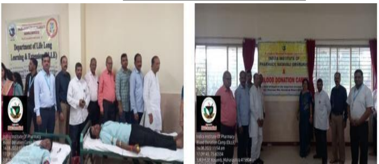
Blood donation camp at Indira Institute of Pharmacy