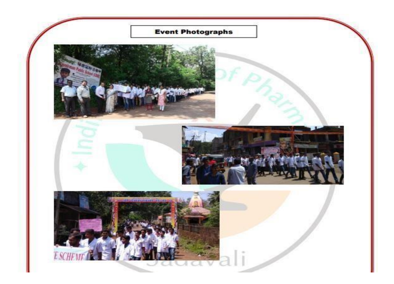
Pharmacist Day Awareness Rally organized at Devrukh

A/P. Sadavali (Devrukh) Tal: Sangameshwar, Dist: Ratnagiri-415804 (Maharashtra) Phone: 02354-241799 Fax: 02354-241499 E-Mail: info@iip.ind.in Web: www.iip.ind.in NAAC Accredited