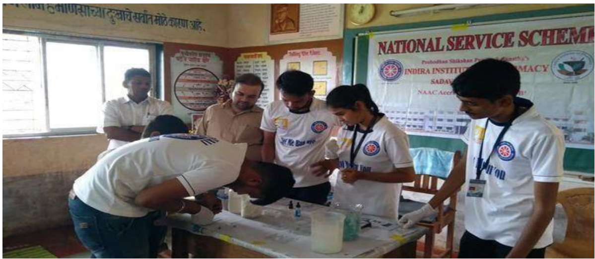
Health check-up camp at Kankadi village