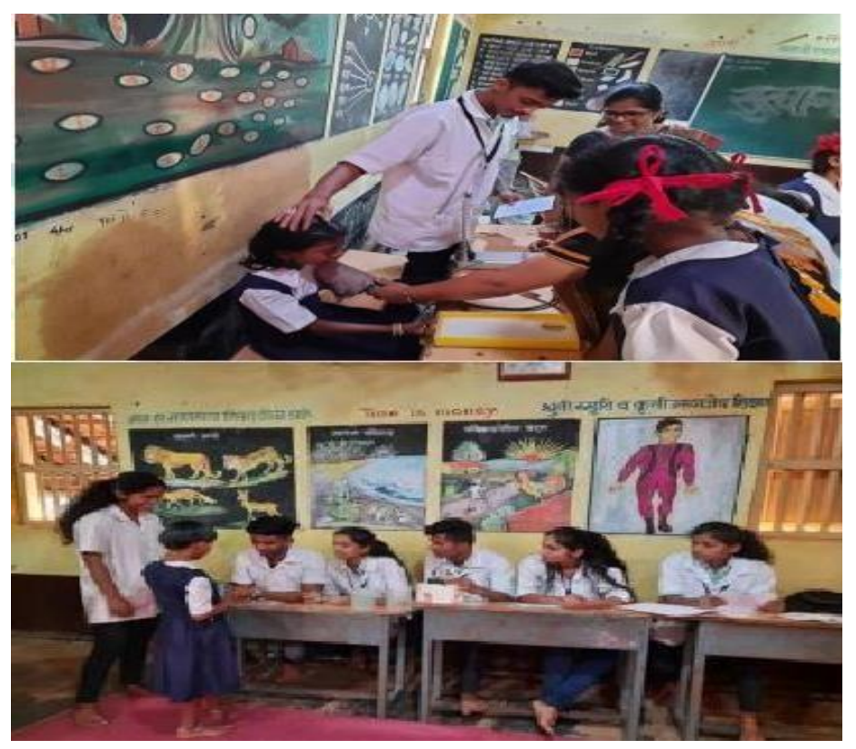
Health check-up camp at Z. P. School, Phansavle