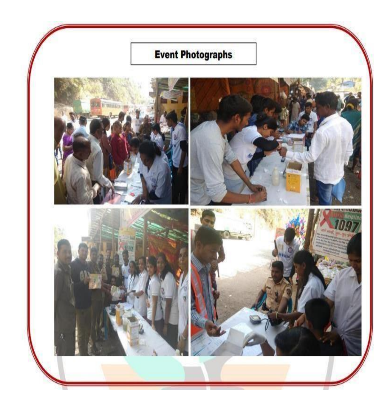
Health check-up camp at Marleshwar Temple

A/P. Sadavali (Devrukh) Tal: Sangameshwar, Dist: Ratnagiri-415804 (Maharashtra) Phone: 02354-241799 Fax: 02354-241499 E-Mail: info@iip.ind.in Web: www.iip.ind.in NAAC Accredited