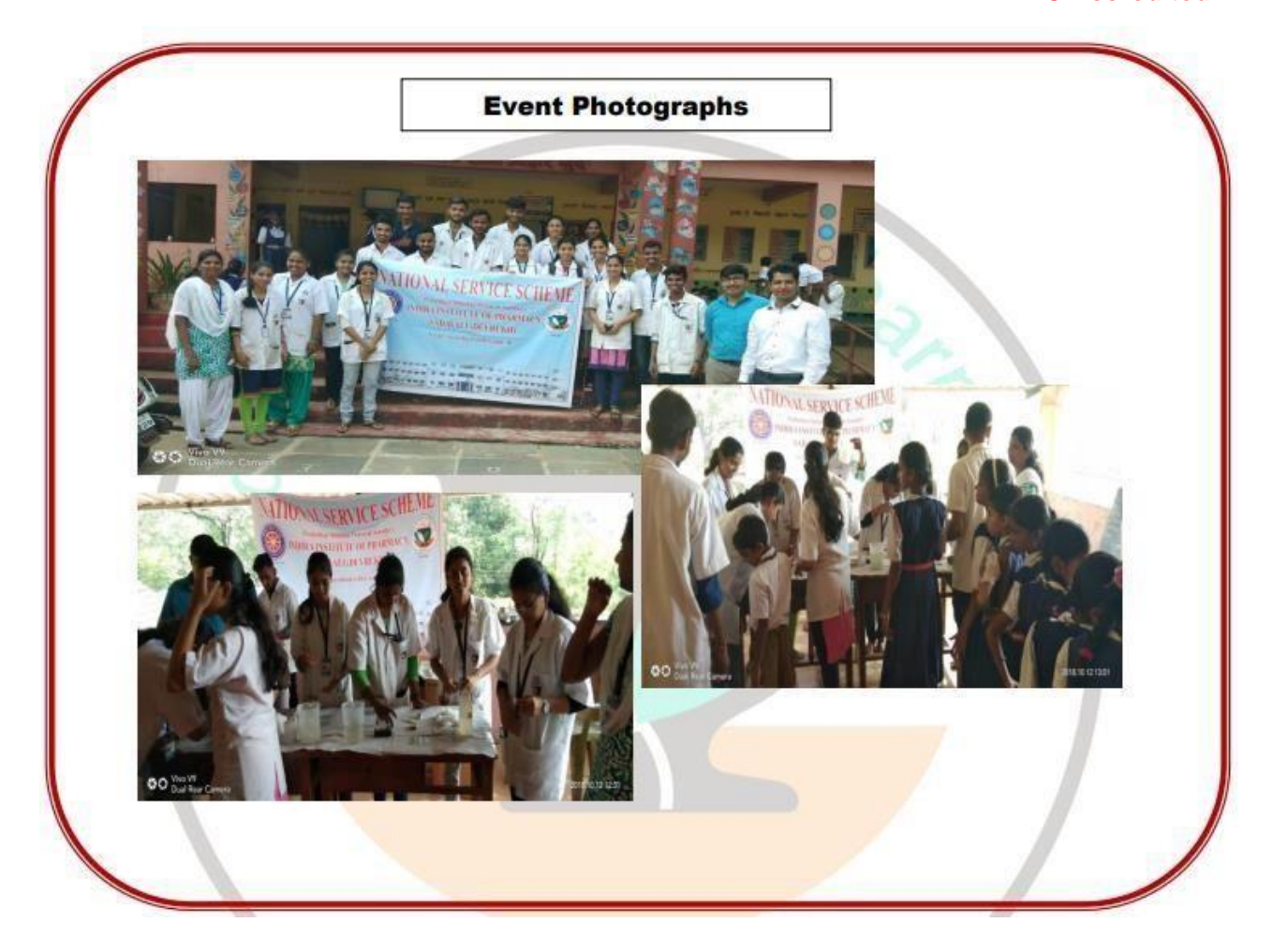
Blood group detection camp at Z. P. School, Ozare

A/P. Sadavali (Devrukh) Tal: Sangameshwar, Dist: Ratnagiri-415804 (Maharashtra) Phone: 02354-241799 Fax: 02354-241499 E-Mail: info@iip.ind.in Web: www.iip.ind.in NAAC Accredited